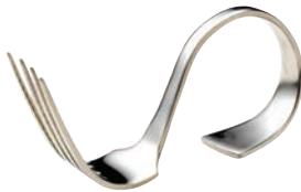
44-81-125 Tasting Fork 11cm