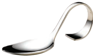
44-82-125 Tasting Spoon 13.2cm